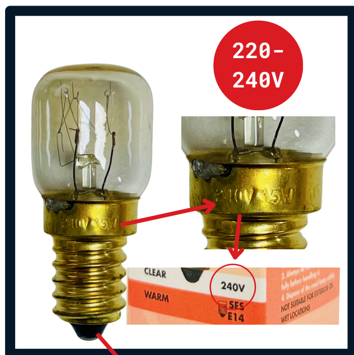
Slender generic plug

Warning: This information is intended for Saltco products only, including Saltco-branded cords and globes. While pairing different brands with our products is possible for experienced users who fully understand voltage pair requirements, it is not recommended for novices. If you're inexperienced, do not attempt to mix brands, as it may lead to compatibility or safety issues. Proceed at your own risk.