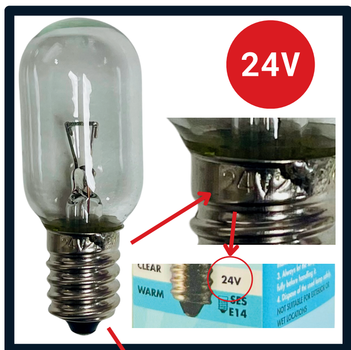
Big chunky plug